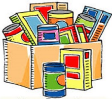
Feeding the Community

From The Gibson Center: Thanks to the Jackson Church, and the many generous people in the valley we have sent out our first batch of emergency meals to our meals on wheels recipients. We plan on two more over the winter. Each recipient (we have about 100) receives 6 well balanced meals, including protein, milk, vegetable, fruit, and grain. This means The Gibson Center looking for donations for an additional 600- 1200 meals, depending on the weather. (meals are for people when Meals On Wheels is cancelled due to weather).